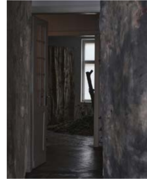
Documentation of the diploma installation "Gatherer, Herbalist, Witch" at Lokal_30 Gallery (2021).

Excerpt from the exhibition description: "The main element of the project was the process itself - the day of going out to harvest, interacting with the plants, the identity of the Gatherer. Then the application of the practice of the Herbalist, when the herbs boil and give up the dye in the vat. And the final transformation into the Witch when interacting with the canvas, in the process of the creative ritual."